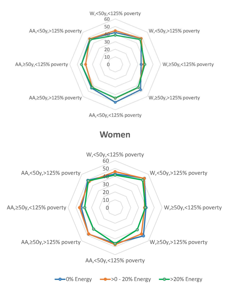
Figure 2. Predicted Healthy Eating Index (HEI)-2010 scores at age 50 for African American and White HANDLS study participants by initial age cohort (<50 or \geq 50 years at baseline visit) and by poverty (<125% or >125% poverty threshold) for three levels of energy intake (0%, >0–20%, >20% kcal) contributed by sandwiches. HANDLS-Healthy Aging in Neighborhoods of Diversity across the Life Span. Women W—White, AA—African American.